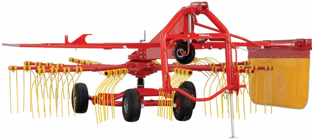
Photograph for illustration purposes only

Fast clean raking of hay and silage for baling. The walking-beam tandem axle provides excellent tracking of ground contours. Adjustable curtain position for variable swath and overall working width.